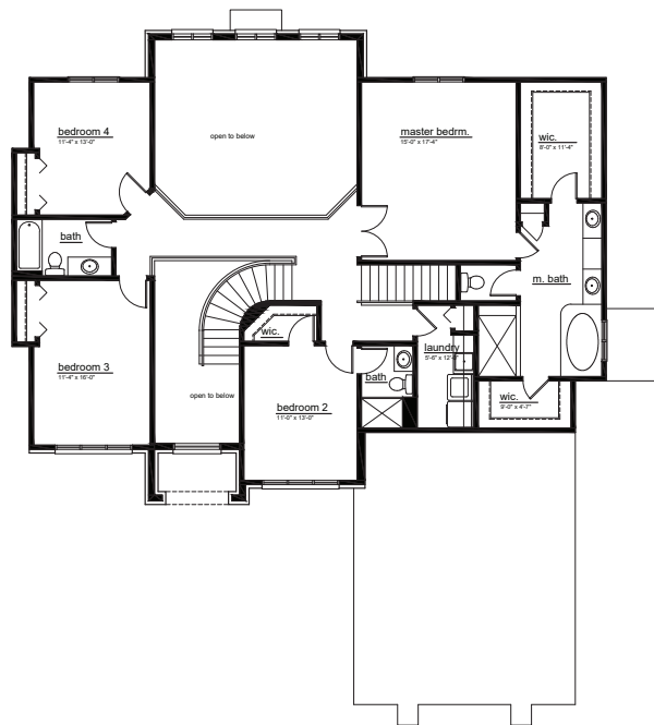
second floor plan