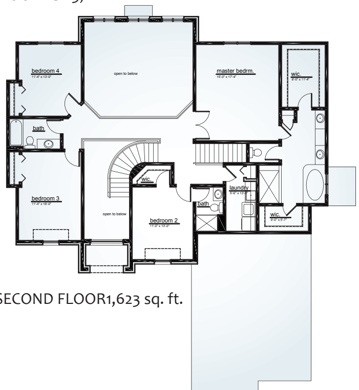
SECOND FLOOR 1,623 sq. ft.

This depiction represents an artist's conception of the elevation and floor plan and is not intended to be an exact representation or show specific detailings. Plans remain subject to change without notice. Drawings are not to scale. All measurements shown are approximate and not necessarily to scale. Location, size and construction of doors, windows, wall, fireplace and any other items depicted may vary depending on elevation preference or choice of options and are subject to change without notice. Some options and elevations shown may not be available in every community; see Sales Manager for details. Due to normal construction tolerances, the room sizes may vary slightly. The Builder may change home design, materials, features and methods of construction without prior notice. Model homes may contain some option features not available through the Builder.